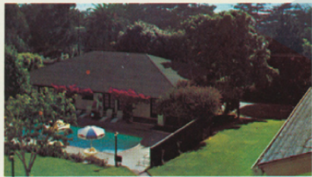
La Playa Hotel