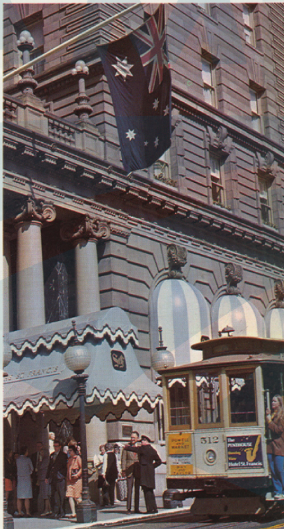
Hotel St. Francis