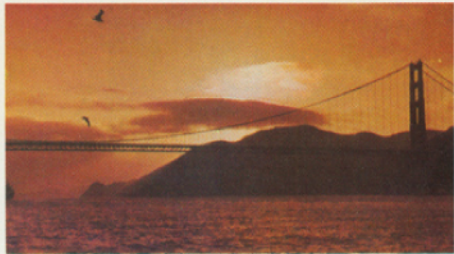
Golden Gate Bridge